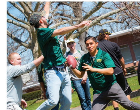
Students enjoy a game of touch football on the Rutherford campus.

Since 2012, a dramatic and measurable transformation of student life on campus has had a profound and tangible impact on the overarching Felician community experience. Among other things, the residence life program nearly doubled in size; co-curricular programming increased by a whopping 2,000 percent; student government has a student-managed budget for the first time in the history of the school; there are more than 15 active clubs and organizations; and Greek Life began in 2014, currently at three chapters with approximately 30 members.